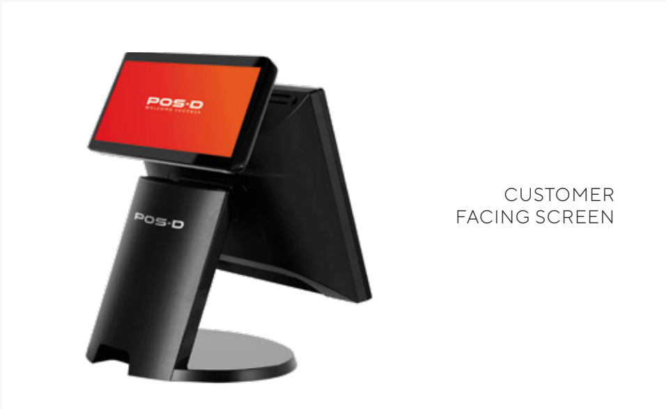
CUSTOMER FACING SCREEN